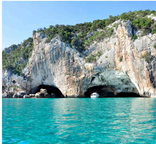
Les Calanques (Marseille) 卡朗格峽灣(馬賽)