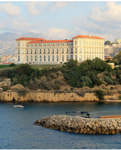
Le Palais du Pharo (Marseille) 法羅宮(馬賽)